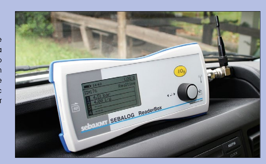
Reader 3 at an online measurement with Sebalog Dx

Even when GSM is not used, the data logger transmits all data wirelessly. An integrated radio modem allows communication even through closed manhole covers. Securing shafts or traffic areas for inspections is no longer necessary.