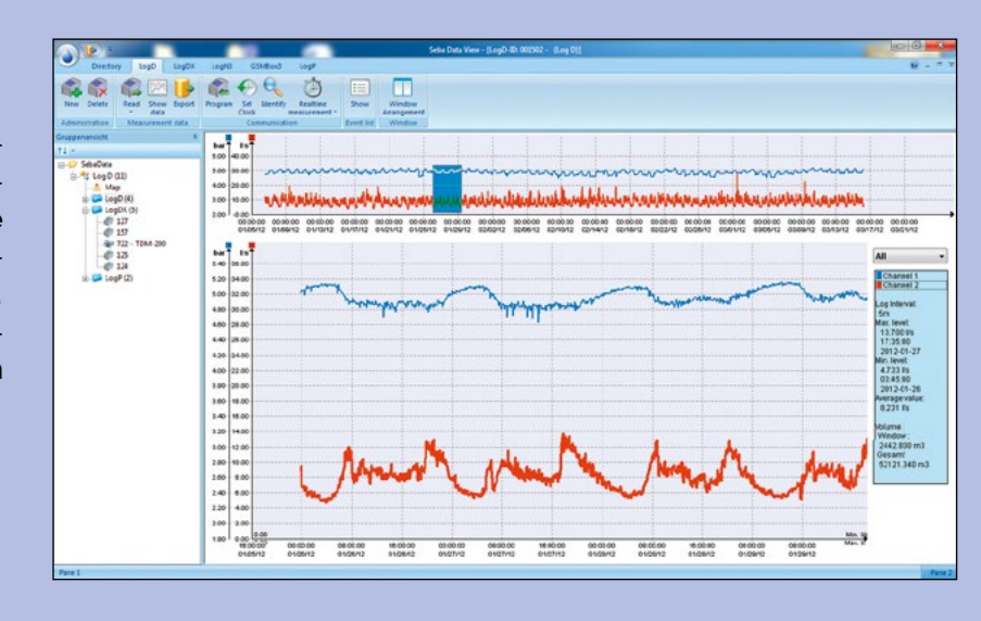
Data set of multiple days showing flow and pressure

Sebalog Dx is able to detect pressure surges with sampling intervals of 1s or 0.1s. You can set the thresholds for the transient pressure yourself at the desired level. The continuous logging is not interrupted in this special detection mode.