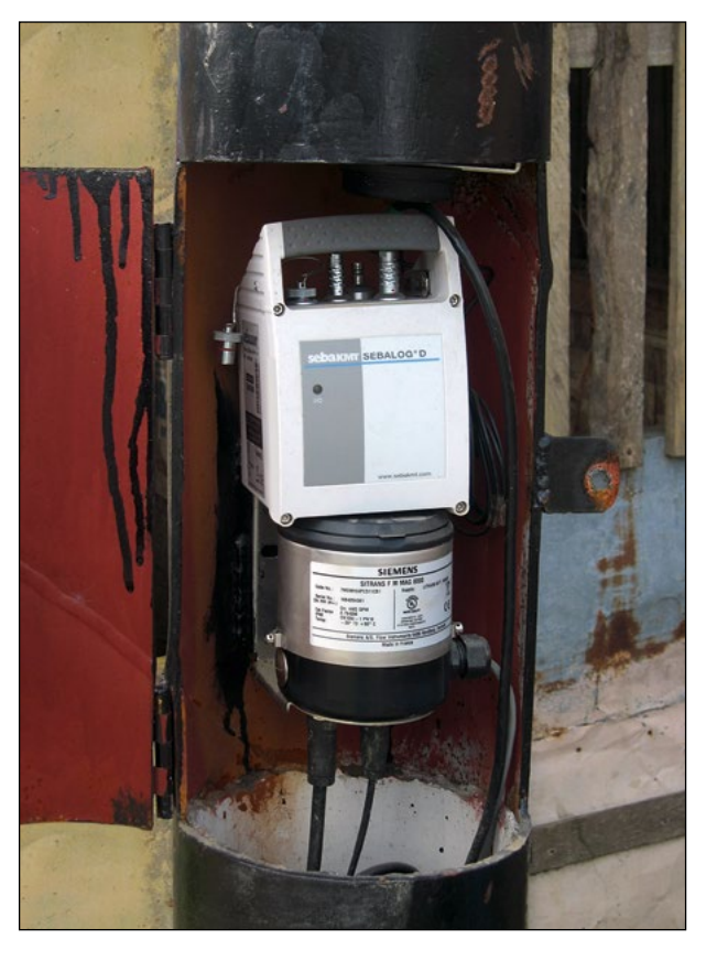
Sebalog Dx data logger connected to a flow meter

The internal battery, which can supply the logger with power for 5 years under standard conditions, and its extremely large memory for over 1 million measurements give you all the freedom you need for your specific application.