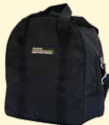
Type-S Reel Bag